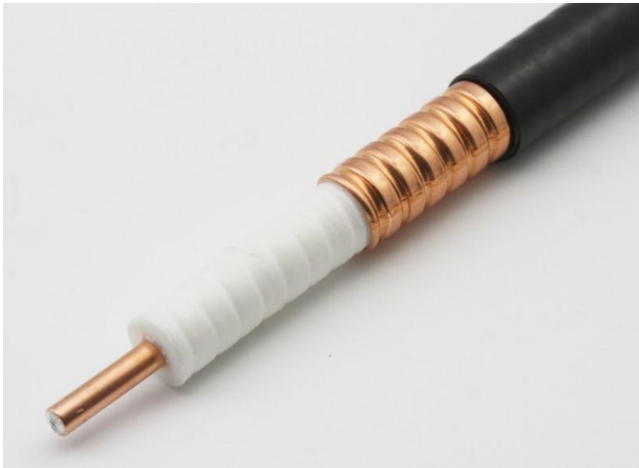
7/8" Standard type RF Cable Picture